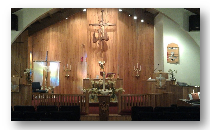
Rides with "Gray Lady II" A Message from the Pastor

This is a great time of year for me. Even more so when I lived up in the upper Midwest. We denize of the "upper tundra" had spent months working through all the gifts of winter. Nothing more fun than shoveling snow for long periods of time or getting stuck in a snow drift. Also, how can one not enjoy below zero temperatures for days up days (especially during my ministry days in North Dakota). While tromping through heaps and depth of snow, blowing meanly upon the face cheeks, dreams of Spring looming warmly in the mind, until shelter of the Church or parsonage was found.